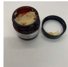
Cannabinoids (% weight)