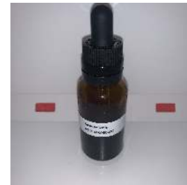
Cannabinoids (% weight)